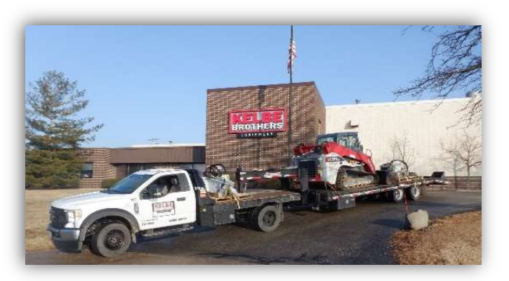
Delivery and Pick Up Available